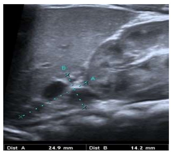
Fig. 1. Increase in the right adrenal gland size. Anechoic lesions are seen with diameters of 9 mm and 8 mm. The size of the adrenal gland 24.9x14.2 mm in diameter.

examination, anechoic cystic appearances were observed in the right adrenal gland. The patient was transferred to the neonatal intensive care unit of our hospital for the differentiation and clinical follow-up of adrenal carcinoma and NAH. After obtaining the patient's history presented above, an abdominal US examination was performed. There was an increase in the size of the adrenal gland and it measured 24x14 mm in diameter. (Fig. 1).