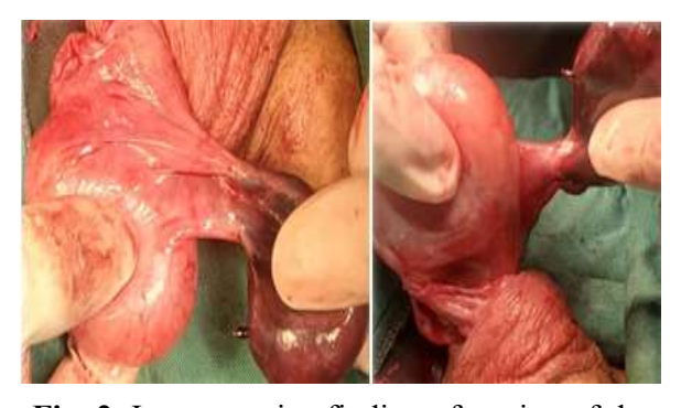
Fig. 2. Intraoperative finding of torsion of the right epididymis. The epididymis is necrotic and edematous, the picture shows a detorsioned epididymis with a pinpoint pedicle.

According to the clinical presentation, painful symptoms and ultrasound result, the patient underwent emergency scrotal exploration to exclude acute spermatic cord torsion. The patient underwent surgical exploration of the right side of the scrotum. Exploration with an oblique scrotal incision revealed that the epididymis was necrotic and edematous due to a 540° torsion, and the epididymis dissociated completely from the testis and was attached to a twisted pin point pedicle (Fig. 2).