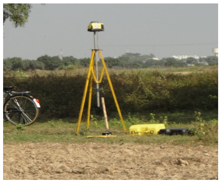
Fig. 1. Laser base station

The study was conducted at block no 6 of Bangladesh Agricultural Research Institute (BARI) field on clay loam soil during Rabi season of 2010-2011. The treatments consisted of Laser land leveling (T<sub>1</sub>) and Control (Non-leveled) (T<sub>2</sub>). In treatments T_1 and T_2 , leveling of experimental field was done as per treatment and information on the topography of each experimental unit was compiled. The net plot size of each treatment measured was 60 X 22 m<sup>2</sup>. A preliminary field survey was done using staff gage. Initially a base station was established to dispense laser ray uniformly as shown in Fig 1. It was a battery operated device, which covers a command area with 500 m radius. The laser ray erected from base station guides the sensor of the stuff gage and the leveler (Fig. 2). Elevation data was collected from the different points of the field as located in Fig. 3. From the elevation data, an average elevation was fixed for the leveler to operate automatically.