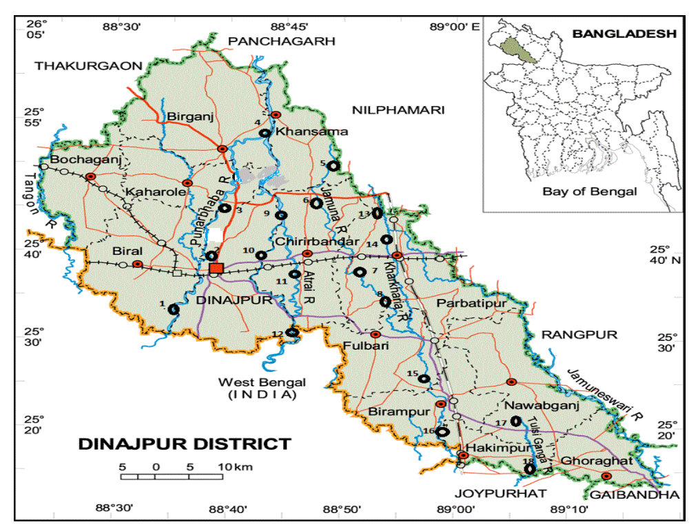
Fig.1. Map of the sampling sites of the 5 rivers (Punarbhaba River-4 sites, Atrai River-4 sites, Kharkharia River -4 sites, Jamuna River-4 sites and Tulsi Ganga River-2 sites) of Dinajpur District.