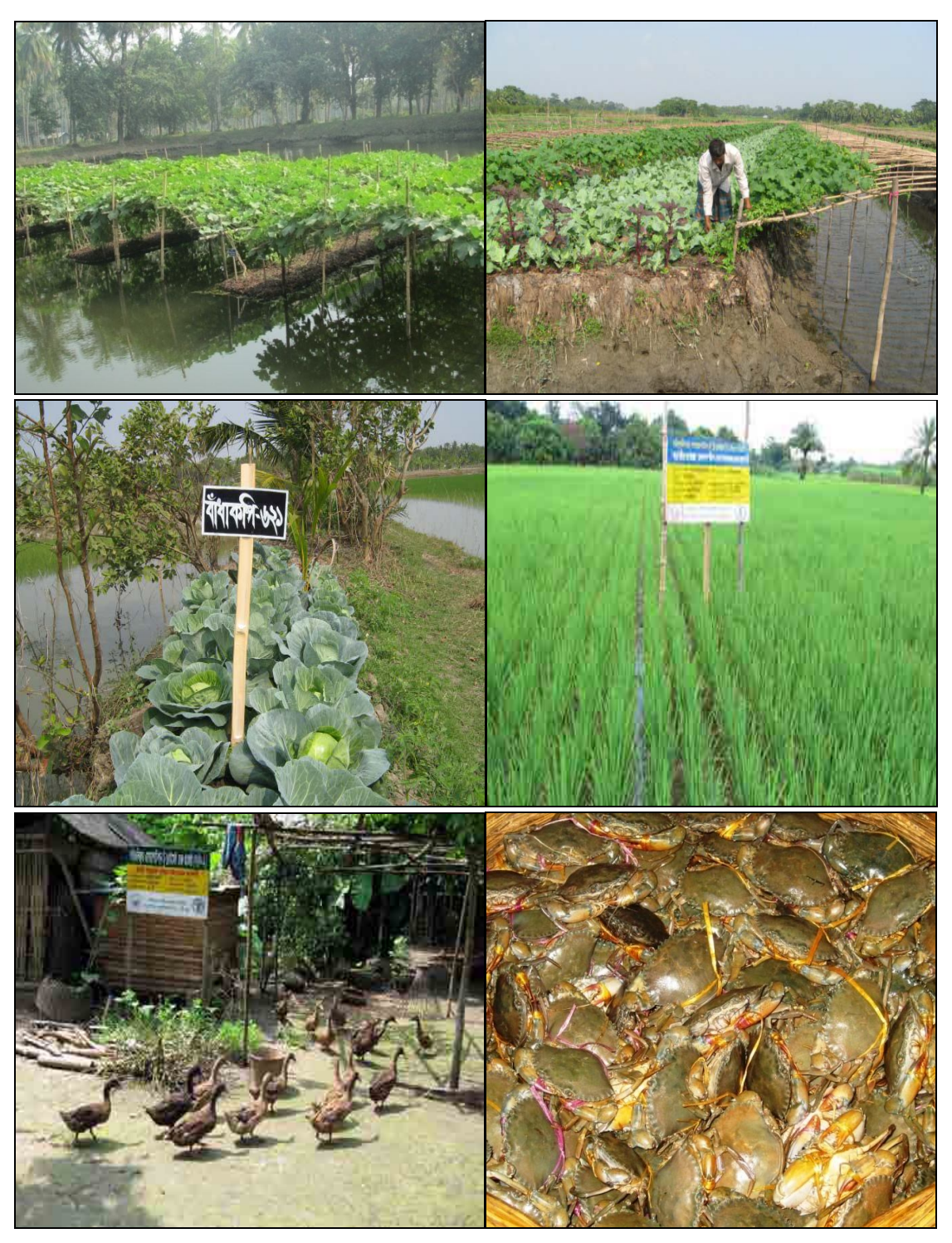
Fig. 2. Practices of some community-based adaptation options: Vegetable cultivation by floating dhap <sup>2</sup> technique(a), and sarjan method (b). Cropping on shrimp farm embankment (c) and saline resistant rice varieties (d). Duck rearing (e) and crab fattening (f) as alternative sources of income.