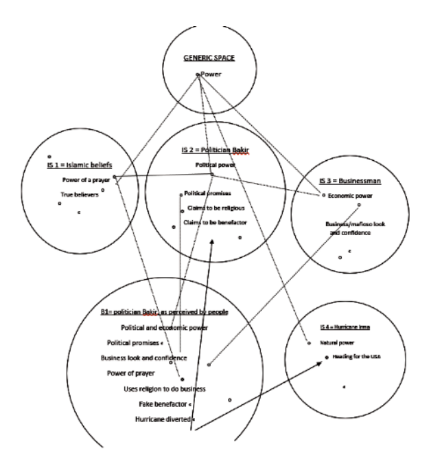
Figure 5. Diagram for Meme 2