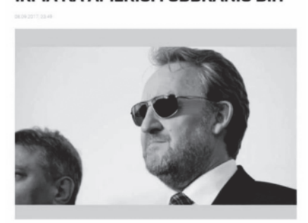
Figure 4. Meme 2