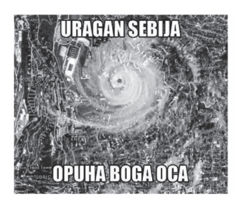
Figure 2. Meme 1