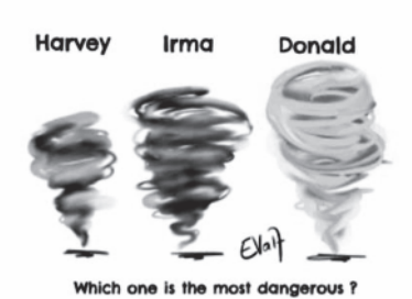
Figure 6: Cartoon 1