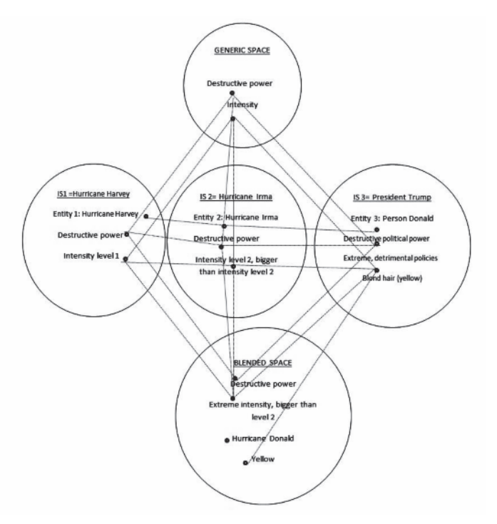
Figure 7. Diagram for Cartoon 1