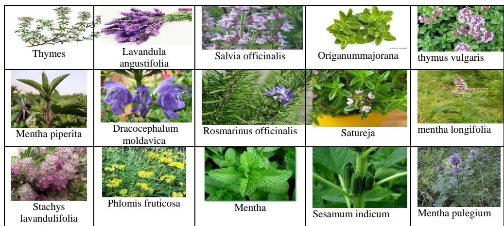
Figure 1. Various types of plants of Lamiaceae family used for the biosynthesis of nanoparticles