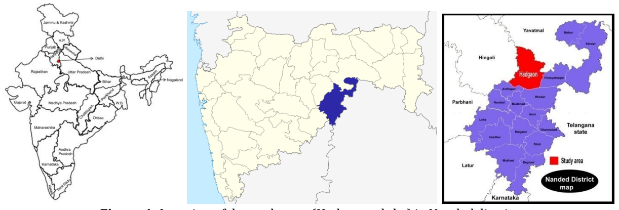
Figure 1: Location of the study area (Hadgaon taluka) in Nanded district