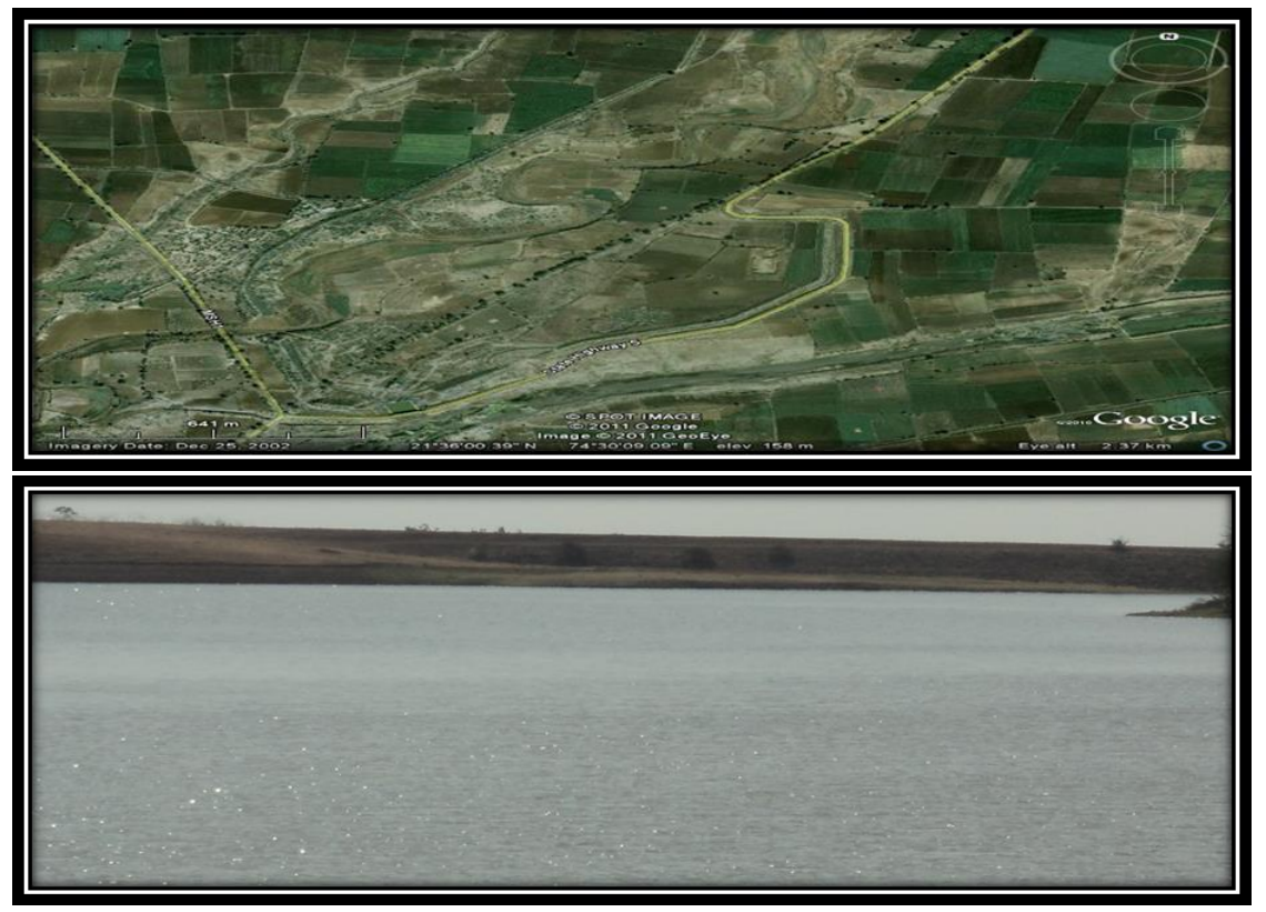
Fig. 1: Satellite image and Panoramic view of Susari dam.

Ten liters of water was filtered using plankton net No. 25 of bolting silk with mesh size 64 \mu m and concentrated to 100ml and preserved in separate vials by adding 1ml of 4% formalin, 1ml of Lugol's iodine was added to it for further qualitative and quantitative studies for quantitative estimation of plankton, 1ml well mixed sample was taken on 'Sedgewick Rafter cell'. The average of 5-8 counts was made for each sample. Qualitative study of phytoplankton were carried out with the help of key's given by Edmonson (1963), Sarode and Kamat (1984) and Battish (1992).