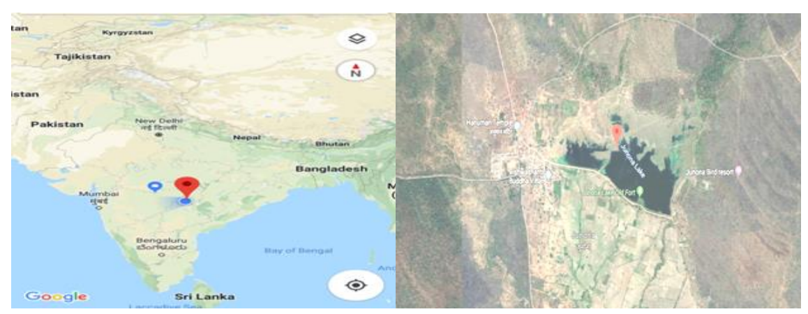
Map shows the location of Junona Lake