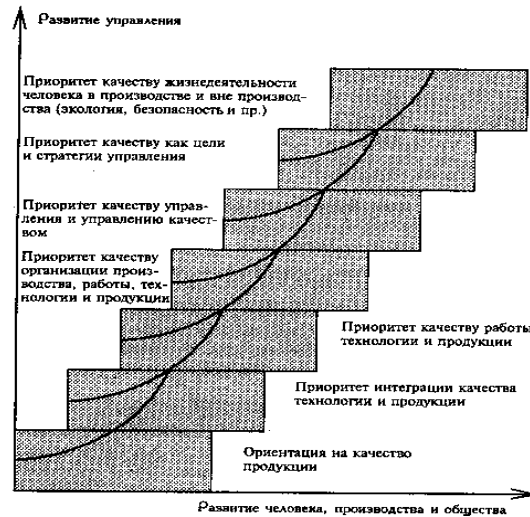
Figure 2 - The quality of work and product quality: the interdependence of tendencies

Achieving quality requires a certain cost. The value of the quality of the cost - the most important characteristic that reflects the quality of management. But the cost of quality is not yet characterize the potential to achieve quality. Costs can be very high, but lower quality because the costs not always have immediate and direct impact. They sometimes serve only the sequence of formation of quality building, such as the qualification of the cost of employees, production infrastructure. [2]