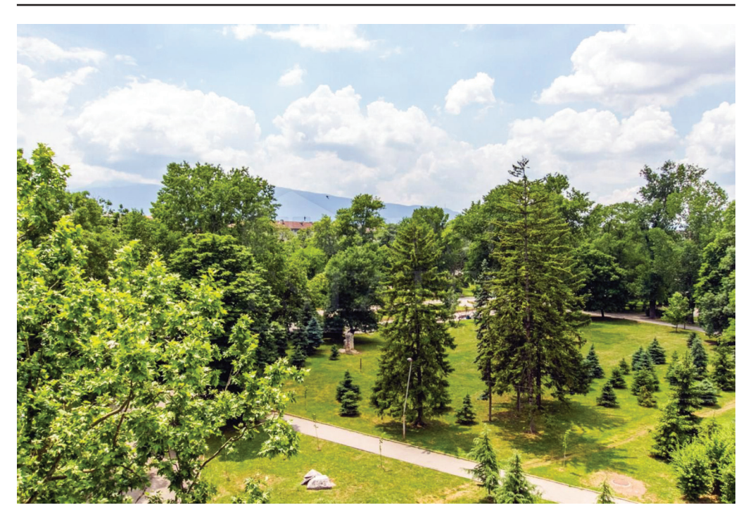
Fig. 4. Park Zaimov nowadays, seen from the residential buildings.

The most planted conifer species has been Picea pungens (Fig. 4), which has good tolerance to dry and polluted air and must be preferred to Picea abies. The Norway spruce needs moist fresh air, which automatically means that those 60 individuals in the park are already suffering or will suffer at some stage. The placement of the evergreen vegetation is also an issue, because in the borderline adiacent to the most intense traffic there isn't any evergreen vegetation, except one big patch of Mahonia aquifolium, which for some unknown reason has been kept as low as half a meter tall. The other exception is a group of Platycladus orientalis trees planted under the canopy and had never been pruned. As a result, they don't fulfil their aesthetic targets, neither the ecological ones. More evergreen shrubs and trees planting needs to be considered