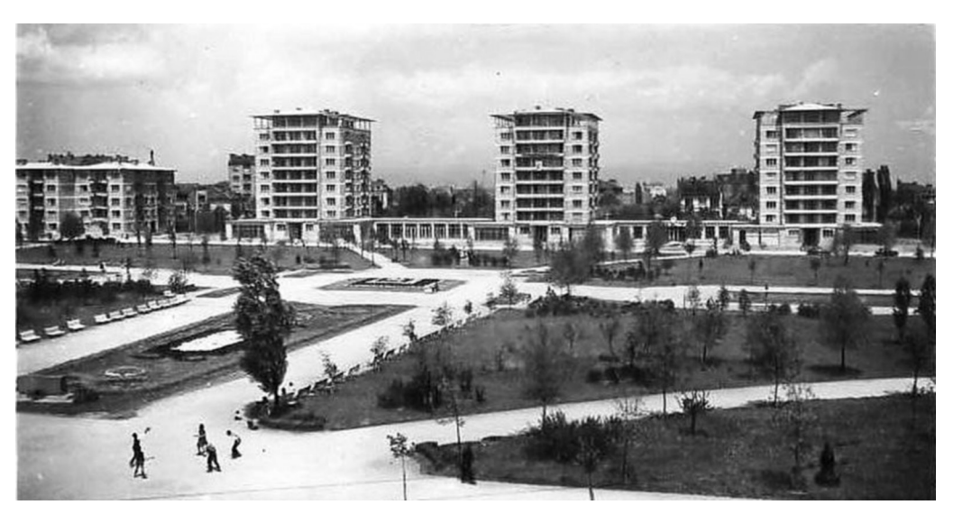
Fig. 1. Park Zaimov when built (Anonymous 2019b).

The aim of the study is to make objective assessment of the woody vegetation of the park and to give recommendations for future reconstructions, so to maximize the benefits of this urban green area.