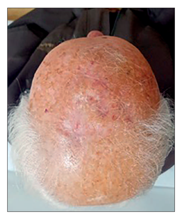
Fig. 2. Postoperative aspect 12 months after the reconstructive surgery.

According to the specialized literature, the incidence of the squamous cell carcinoma is increasing worldwide. Statistics in the United States show that the risk of occurence of this condition during lifetime is between 9 and 14% for men, while for the female population the values vary between 4% and 9%. Annually, United States report between 200,000 and 400,000 new cases of squamous cell carcinoma,