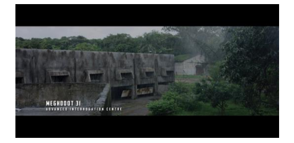
Fig. 3. Meghdoot 31: screenshot

Horror Genre: It is a Lovecraftian format of horror, where man/mankind is a child merely, trapped in a situation which is much more immense than he can assume. A common trope in the horror stories appearing in the western world (Lovecraft, 1992). Lovecraftian horror has an individual who understands his or her insignificance in the larger scheme of things and goes insane while understanding this. The settings of Lovecraftian horror were usually desolated and away from the civilization like the unit Meghdoot 31 in this case (Figure 3). Lovecraftian horror also draws upon the helplessness and hopelessness of individuals facing a problem.