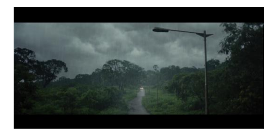
Fig. 5. Ghoul (2018): screenshot

It also rains throughout the major part of the film. From dripping to torrential downpour, depending upon the amount of drama in the story at the moment (Figures 5 and 6). The metaphor of long dark and rainy night is depicted throughout the narrative.