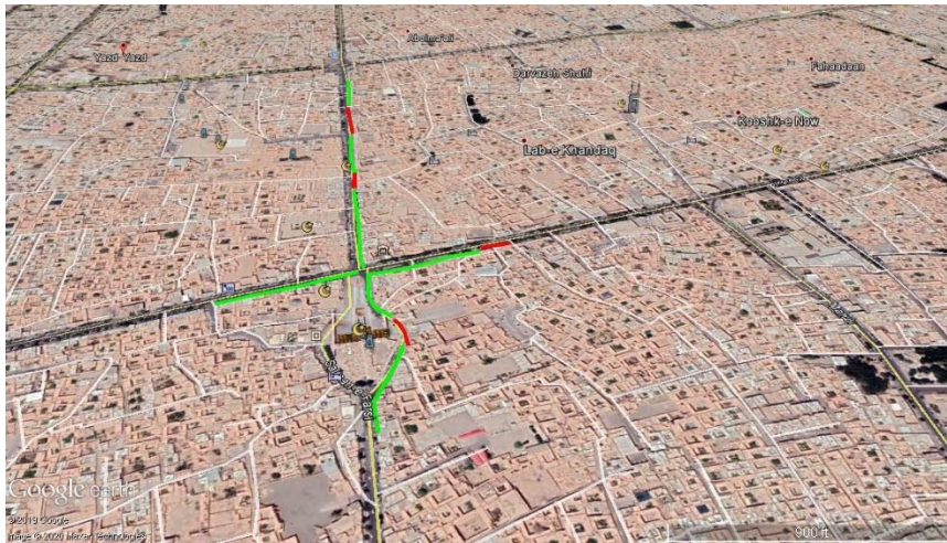
Fig. 4. General condition of the SCI (green colour has a relatively good index, and red colour has a weak index)