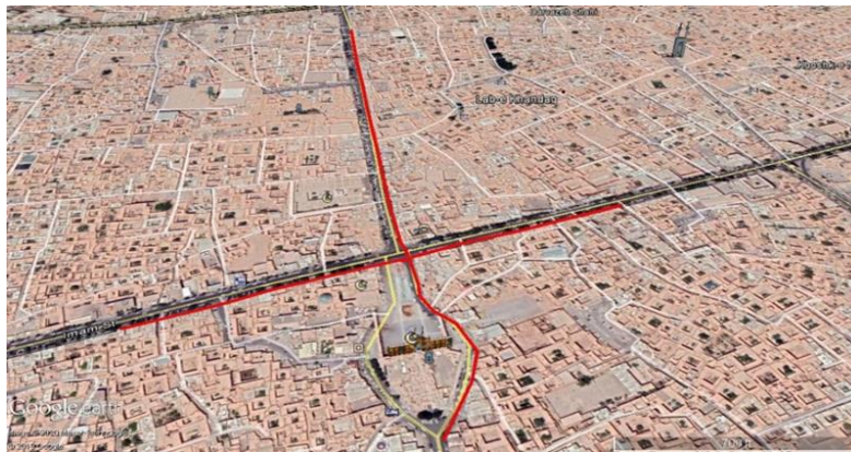
Fig. 1. The path under study (red path)

Investigating the region under study, randomly and regularly, the approximate number of vehicles (about 3000 per day) and the number of pedestrians (about 2000 per day) can be estimated, which indicates that it is a dense region in terms of pedestrians. Such factors as the roughness of a sidewalk, presence of trees, width and quality of the path have a great effect on the number of pedestrians. The use of the region has changed over time, and the trade centres and stores have changed to schools or vice versa. The conversion trend of stores to parks and squares or even cross-sections or conversion of unused spaces to stores or trade centres have been existing to satisfy the needs of pedestrians. In these locations, only vehicles on low speeds are allowed to move due to the high density and volume of pedestrians.