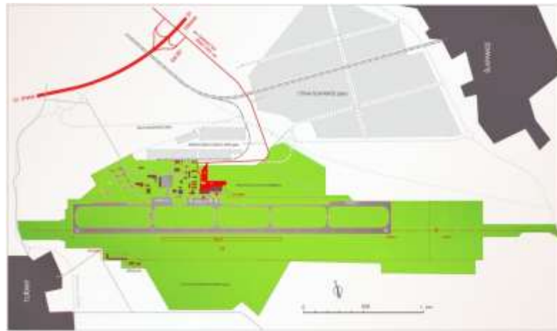
Fig. 1. Graphic scheme of the public airport Brno-Tuřany

The airport terminal is located 1.6 km from the D1 motorway, close to exit 201 Brno-Slatina and a public logistics centre built around the terminal.