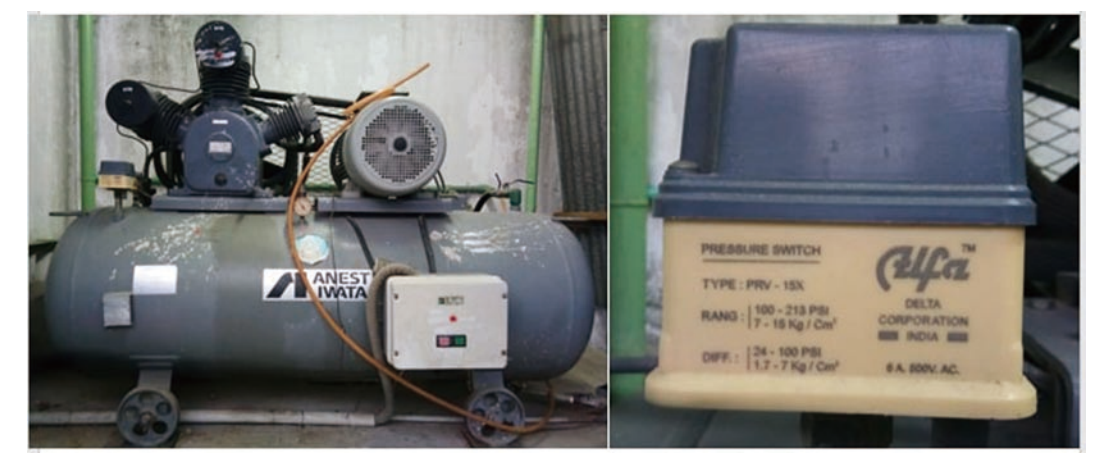
Figure 1. High pressure compressed air jet equipment.

Contrast enchanced CT abdomen revealed pneumoperitoneum, pneumopericardium, and left-sided pneumothorax (Figure 2). A left-sided intercostal chest drain was inserted in view of pneumopericardium communicating with left pleural cavity. On emergency exploratory laparotomy, gush of air was released on opening peritoneum, and findings were 1 L of hemoperitoneum, grossly distended small bowel, multiple lacerations with serosal tears, and full-thickness 12 cm perforation in the sigmoid colon. Resection of perforated sigmoid with recto-descending colon anastomosis and transverse loop colostomy was done.