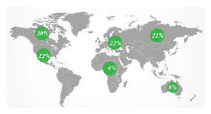
Figure 2. Dispersion map of the reviewed articles around the world