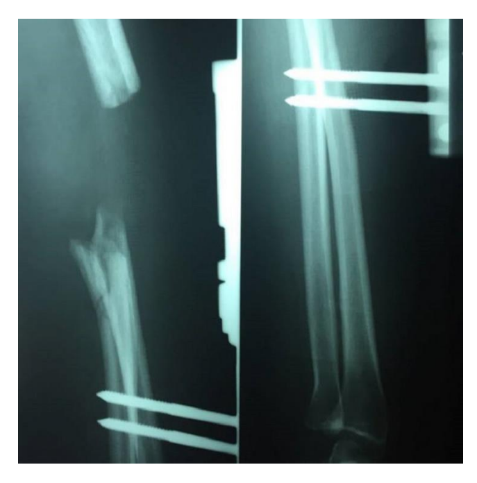
Figure 3. Radiographic view of the external fixator.

4 months after the accident the external fixator is removed (Figure 4: on the 4 months control radiograph the bony ends are viable and healed after the removal of the external fixator, the huge bone loss resulted in a 12 cm shortening of the limb), and the patient is advised to perform medical rehabilitation, with the left superior limb immobilized in an elbow functional brace with limited mobility, and almost after 1 year, in 16. March of 2016 in general narcosis with intra-tracheal intubation total elbow arthroplasty (TEA) is performed with Conrad-Morrey type