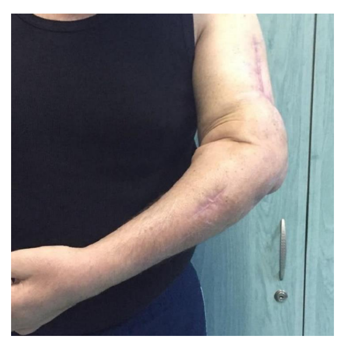
Figure 8. Range of motion after 3 years.

On the radiograph, a good bony integration of the prosthesis can be observed, without radioulnar synostosis, with the previously mentioned shortening of the bones, the proximal parts of the forearm bones slightly deformed. The autologous bone allograft inserted into the anterior flange of the prosthesis is fully integrated