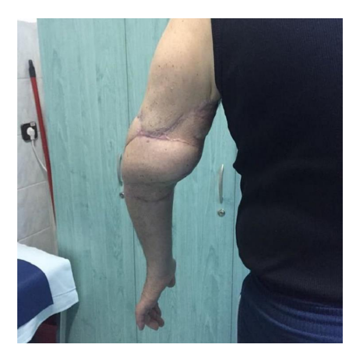
Figure 9. Posterior aspect and mobility of the limb.