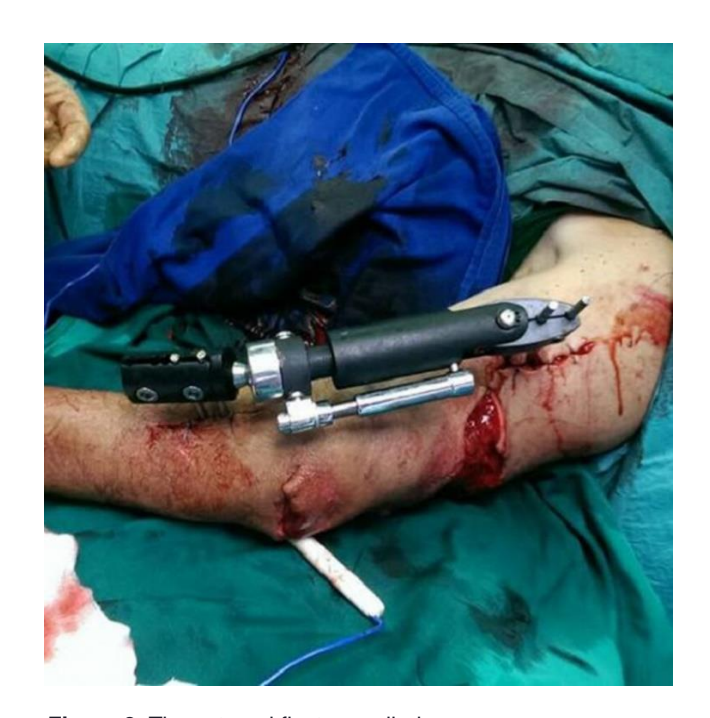
Figure 2. The external fixator applied.