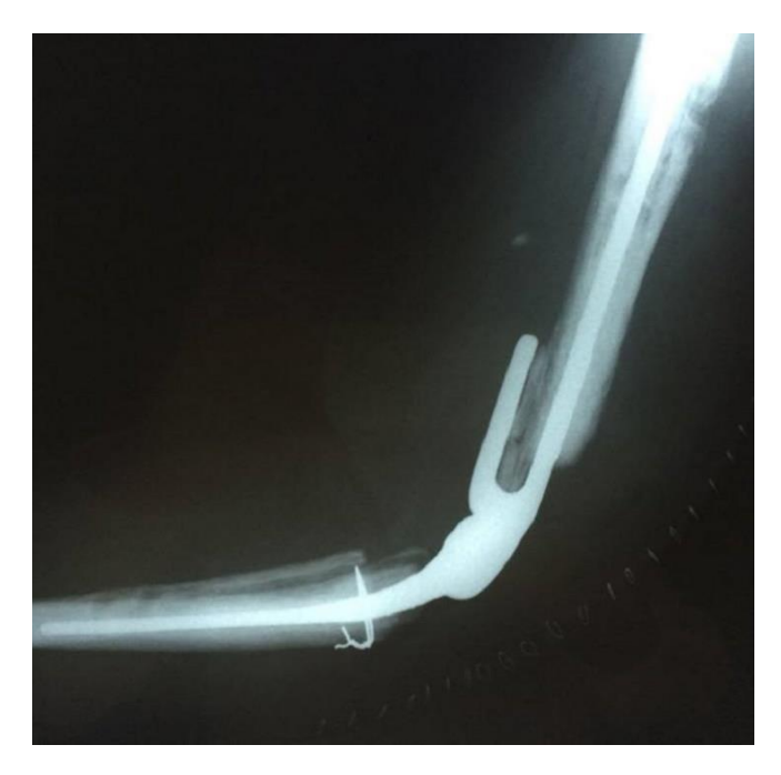
Figure 7. Radiographic view of the Conrad Morrey Prosthesis LL.

shorter: 8 cm shortening from the humerus and 4 cm shortening from the bones of the forearm.