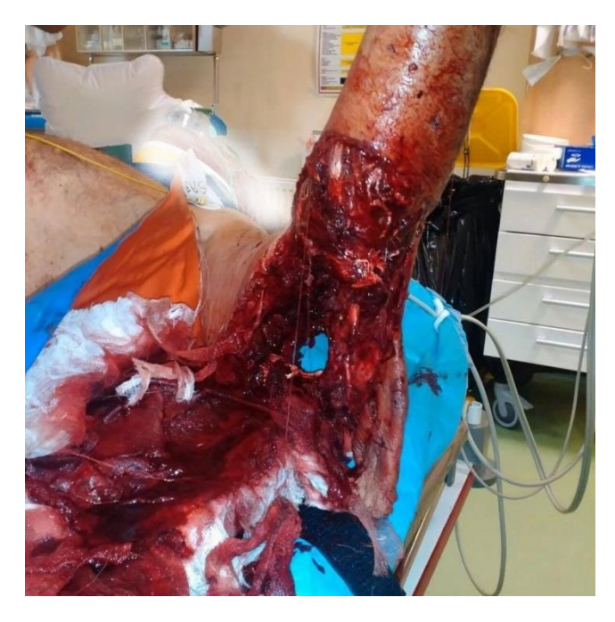
Figure 1. The injury.

minor pneumothorax. Immediate surgical care was decided to be performed, but there was a huge question mark about preserving the limb itself. The huge soft tissue laceration, the bone loss, the level of the contamination and the nerve injuries showed a bad sign about the outcome. The first surgical care consisted of cleaning the wound and debridement of the devitalized soft tissues. We performed partial resection of the humerus, which was comminuted with bone loss, and both bones of the forearm, primary wound correction and external fixation of the bones proposed in the light the contamination (Figure 3: The postoperative radiograph showing us the amount of the bone loss in the cubital area, with the external fixator applied).