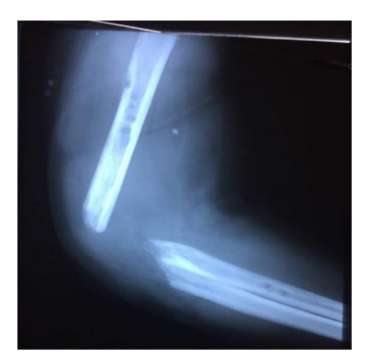
Figure 4. Radiographic view after removing the external fixator.