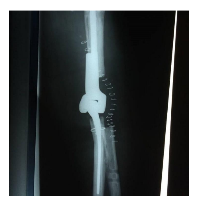
Figure 6. Radiographic view of the Conrad Morrey Prosthesis AP

promising results. He presents some scar tissues healed without any problem. Although there is hypertrophic scar tissue in the axillar region, which limits the abduction movement of the left arm after de LD transplantation. As mentioned before thanks to the type and nature of the trauma, and the excessive bone loss the left arm is 12 cm