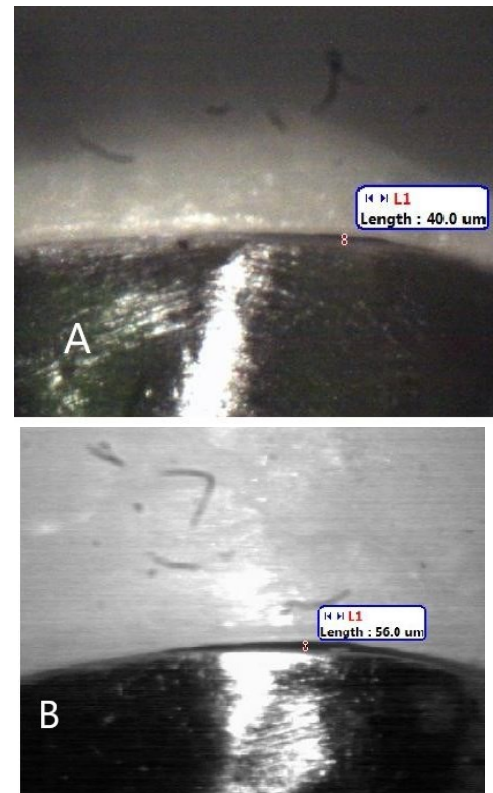
Figure 1. Measuring marginal fitness of crowns on metallic dies under a stereomicroscope (40X). A: before applying the veneering layer, B: after applying the veneering layer

Altstätten, Switzerland ) was used for uniform porcelain placement. From an impression of an enlarged wax-up (DandIran, Tehran, Iran), the index was made to compensate for the sintering shrinkage of the porcelain (20%). The total thickness of the porcelain veneer was 1.25 mm before firing. Three firings were needed for each sample. The porcelain was glazed (Vita Akzent; Vita Zahnfabrik, Germany) with the final firing.