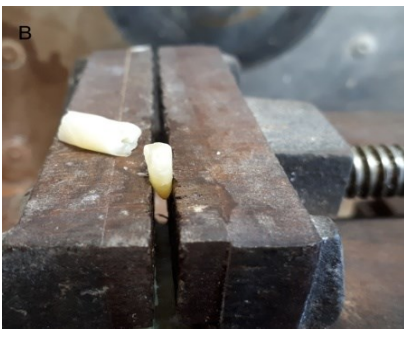
Fig.1 A. The teeth were placed in industrial clamp. B. Broken tooth horizontally