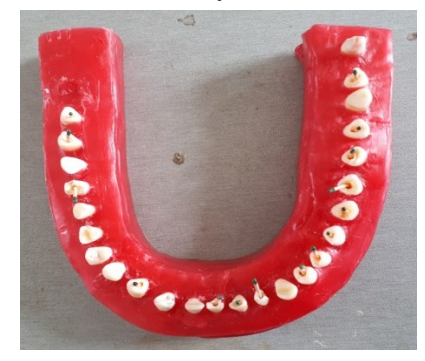
Fig.2 mounting teeth in the U-shaped wax rim.

Radiographic examination: The CBCT scans were obtained using denture scan mode of Newtom 5G System (QR srl, Verona, Italy) set at 110kv and a tube current of 3.46 mA and a mean time of 4.8 seconds with an FOV of 18x16 cm and a voxel size of 0.3 mm. The scans were examined in three planes of axial, coronal and sagittal in multi-planar reformation (MPR) by using NNT viewer software version 3.0 (QR srl, Verona, Italy). The slice thickness was 0.5 mm in this study. Scans were examined by two trained endodontists twice with two-week interval for the presence or absence of a horizontal root fracture (figure 3). The observation was done in a low-light room with the LG Flatron 18.5 inch monitor (LG, Seoul, Korea) and observers were free to choose magnification. In addition, the observers were unaware of how many samples had fracture.