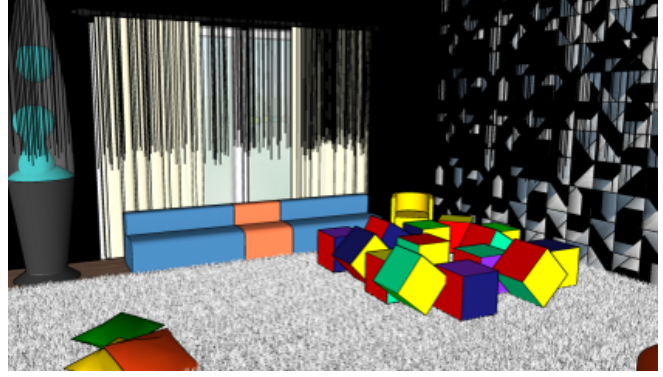
c. Sensory Room