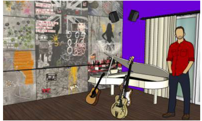
e. Music and dance room