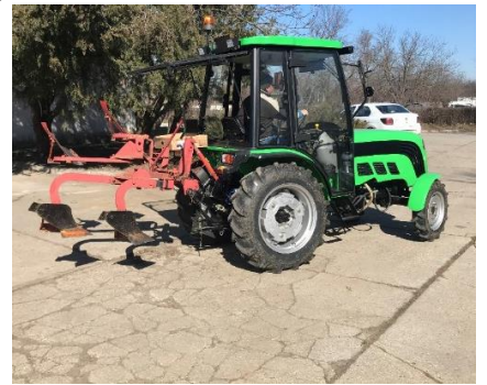
Fig. 1 - Experimental model of electric tractor with plough mounted on

The experiments were conducted on a 28.8 kW experimental model of agricultural electric tractor developed by INMA Bucharest with rear wheels traction. The 17.28 kWh electric battery powering the tractor was fitted with an ORION battery management system (BMS) with possibility of recording the instantaneous power consumption during works. The advantage of the electric motor used for propelling the tractor compared to the diesel one comes from the maximum output torque, even at very low revolutions per minute. The tractor was also endowed with a mechanical transmission with 8 forward gears or reverse shift which allowed for a minimum travel speed of 1.71 km/h and maximum of 26 km/h for a nominal rotational speed of the electric motor of 2350 s<sup>-1</sup>. The weight of the tractor was 1210 kg. For experiments a 2-coulter reversible plough was chosen, which was set for a working width of 0.5 m and a maximum working depth of 0.2 m.