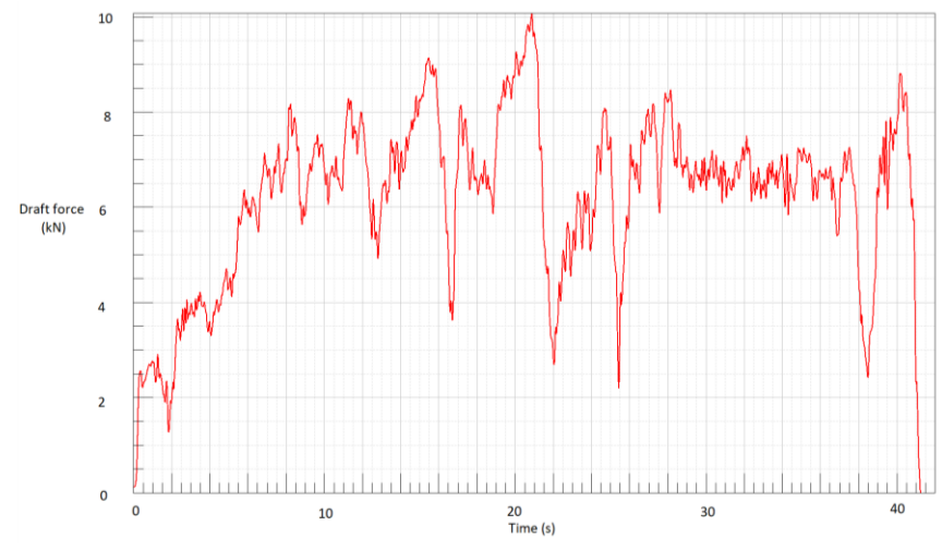
Fig. 2 - Draft force evolution for 1.1 m/s and 0.2 m depth ploughing test

In table 2 are presented the mean results obtained during the tests, for each set of 3 replicas of the experiments. The soil humidity in the tests area was 16%, which is considered to be within the optimal values for ploughing.