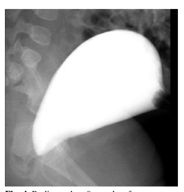
Fig. 4. Radiograph at 9 months of age.