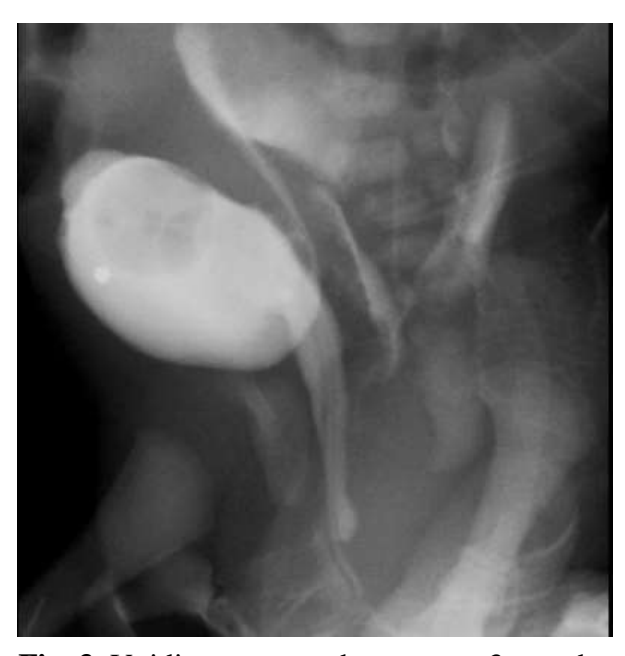
Fig. 3. Voiding cystourethrogram at 3 months.

cannulated. We will await further maturation of the patient and discussions with family for shared decision-making prior to pursuing definitive reconstruction.