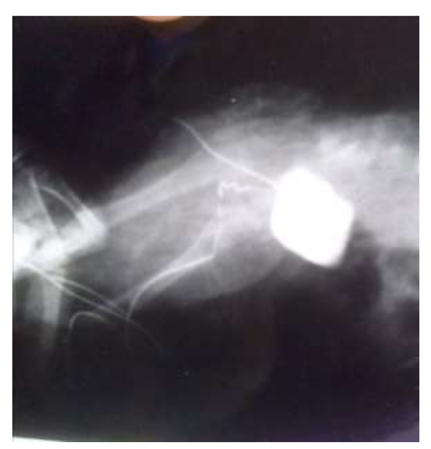
Fig. 2. A contrast in lateral view films shows a characteristic posterior kinking in the urethral wall at the site of origin of the accessory channel.

of origin of the accessory channel could be seen in lateral view films (Fig. 2).