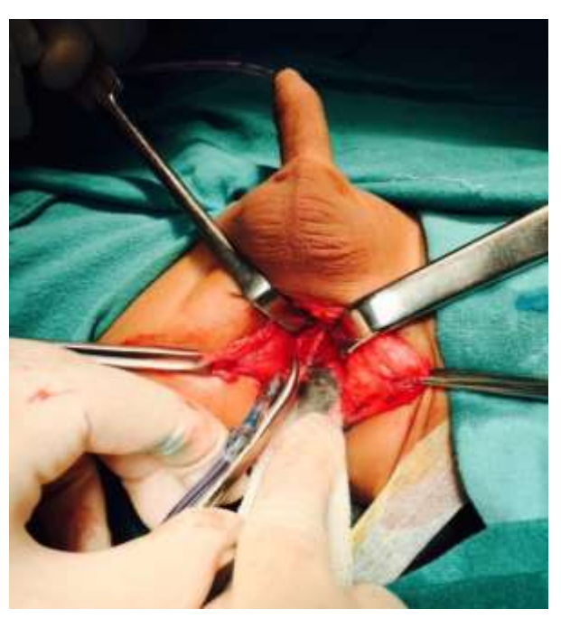
Fig. 7. The orthotopic urethra carefully dissected up to the entry into the posterior urethra.