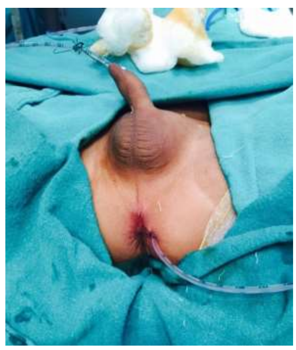
Fig. 6. Heterotopic urethra was cannulated with 7 infant feeding tube and orthotopic urethra was catheterized with 10 Fr infant feeding tube.

On follow-up, all babies were doing well with good voiding stream. In one of three case, progressive dilatation of anterior urethra was done followed by excision of accessory urethra. All cases were calibrated with feeding tube on follow up.