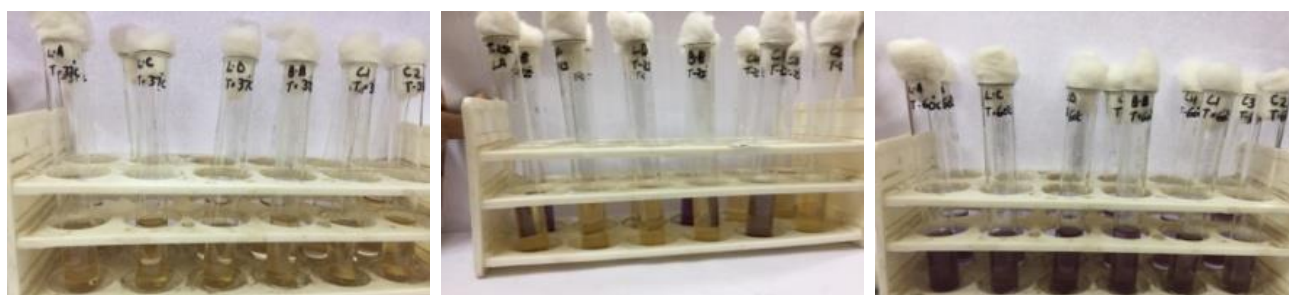
Fig 2:- Temperature tolerance (Yellow color shows positive result , purple color shows negative result)