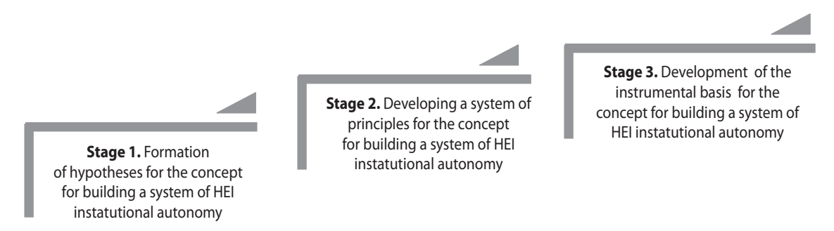
Fig. 2. Stages of developing the concept for building a system of HEI institutional autonomy

Stage 1. Formation of hypotheses and conceptual provisions of the concept for building a system of HEI institutional autonomy. The relationship of the working hypotheses and provisions of the concept is given in Table 1.