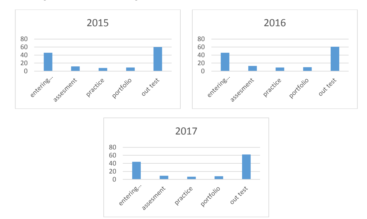
Picture 1. Average Growth Indicators for Years Listed by General scientific and methodical center Students [3]

retraining and upgrading the managerial staff of the higher education system. Dynamics of the results of retraining and improvement of professional skill of pedagogical staff of higher education institutions using modern methods, based on the results of work to ensure the required level of training of highlyqualified personnel and the study of advanced international pedagogical experience are shown in Figures 1 and 2.