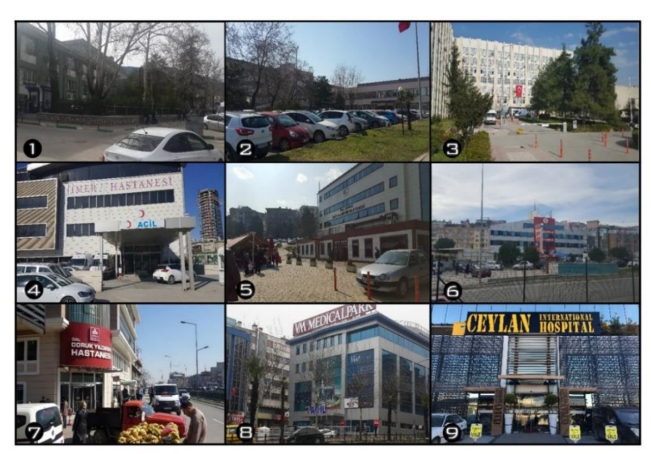
Figure 3. General views of the hospitals (1. Bursa State H., 2. Bursa High Specialty Training and Research H., 3. Uludağ University Training and Research H., 4. Private Jimer H., 5. Çekirge Private Cardiac Diseases and Arrhythmia H., 6. Private Bursa Anadolu H., 7. Private Doruk Yıldırım H., 8. Private Medicalpark H., 9. Private Ceylan International H.)