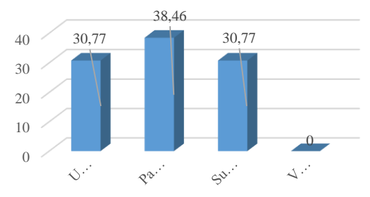
Figure 4. Success scores of the hospitals