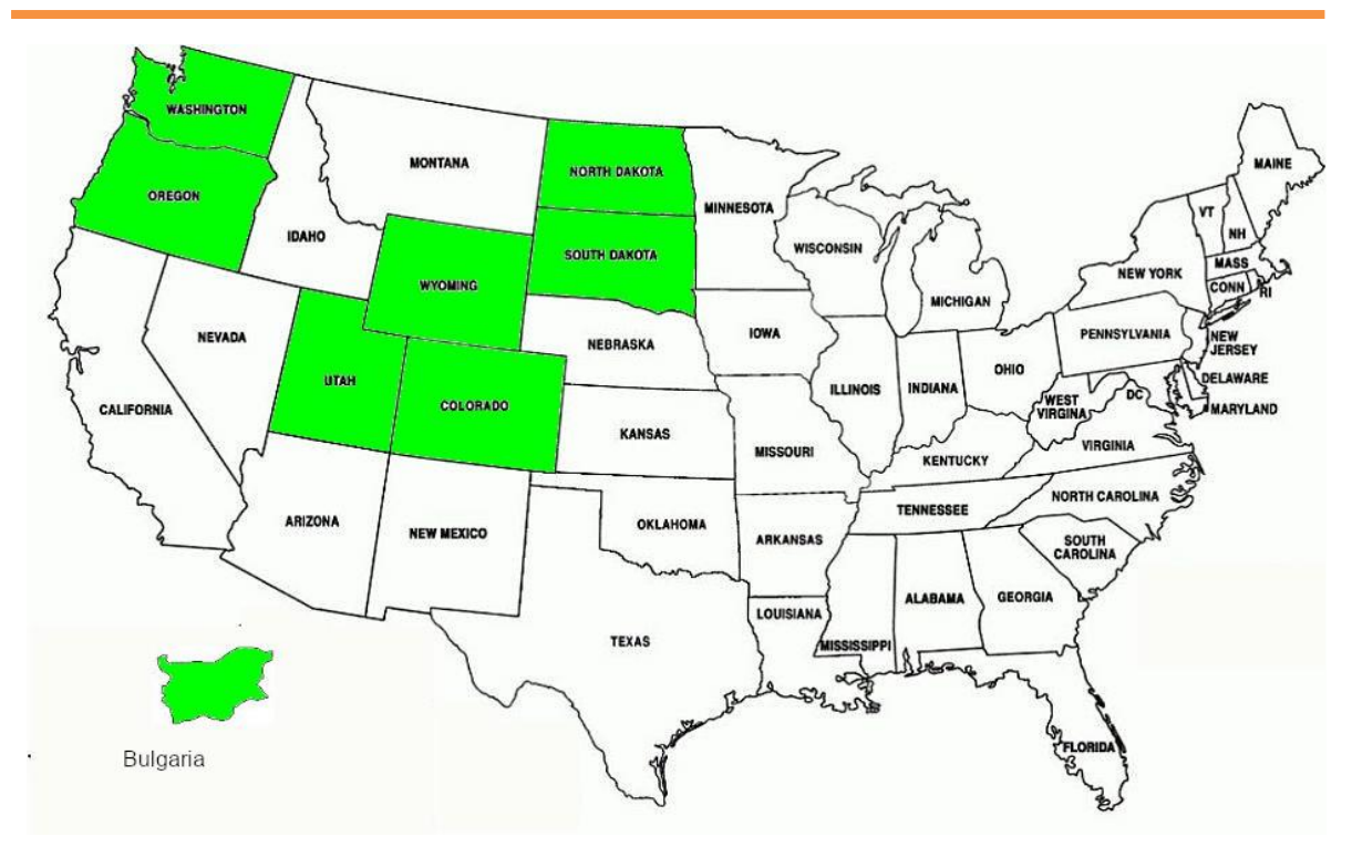
Figure 2. Map of USA showing states with homoclime similar to Bulgaria.

Here is interesting to show the representation of similarity between countries from Europe and Asia to North America (McCarthy, 2016). It can be seen that the countries of Eastern Europe, to which Bulgaria belongs, have a similar climate with the Northwestern states of America, which confirms our analysis and conclusions.