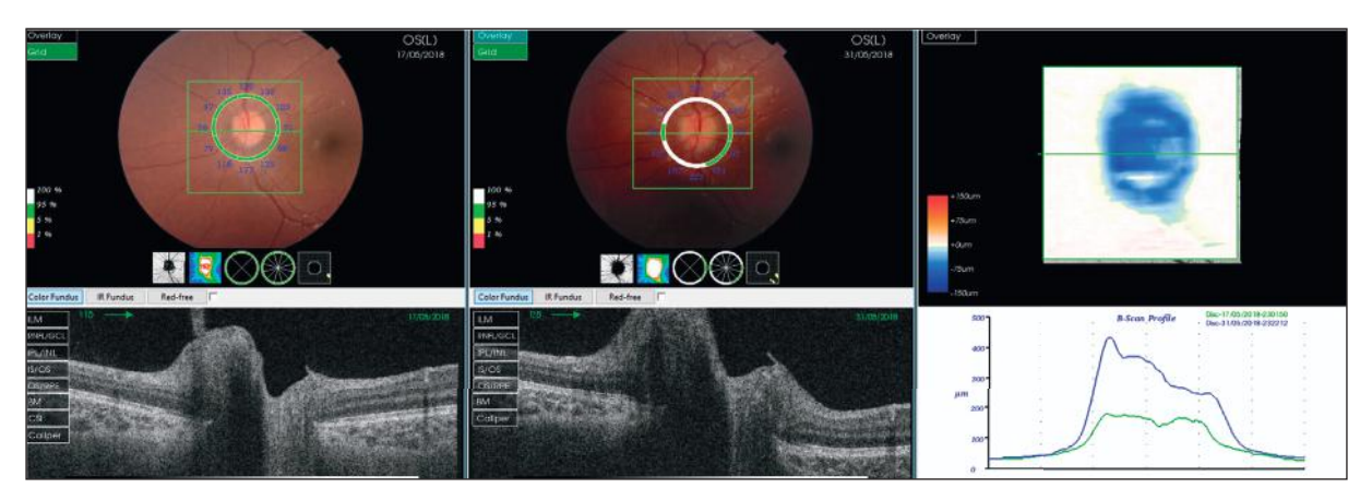
Fig. 3. Optical Coherence Tomography and fundus photo of resolution of papilledema. Comparison between Fundus photo of the ONH edema and OCT measurements taken 2 weeks apart. The thickness graph provides a useful tool to monitor early response to treatment in a relapsing patient with IIH, undetectable through fundus examination alone.