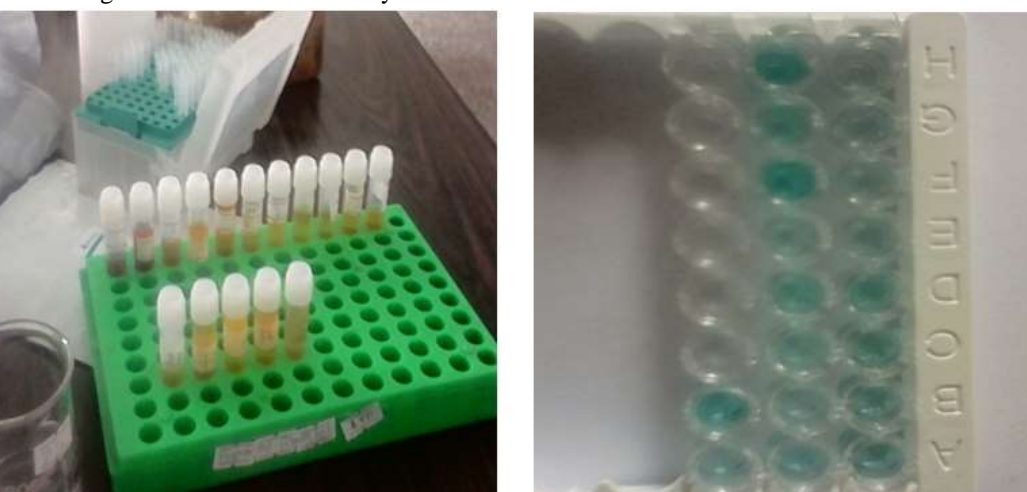
Fig. 3: Serum isolation and BioPRYN test

In the experiment by Howard et al. , (2007) using antiserum against PSPB for the detection of pregnancy in cattle, BioPRYN showed that 51.9% were pregnant at 30-36 days. In our study, the BioPRYN had 100% accuracy for pregnancy diagnosis. However, previous published reports on the accuracy of pregnancy diagnosis using BioPRYN are still scarce.