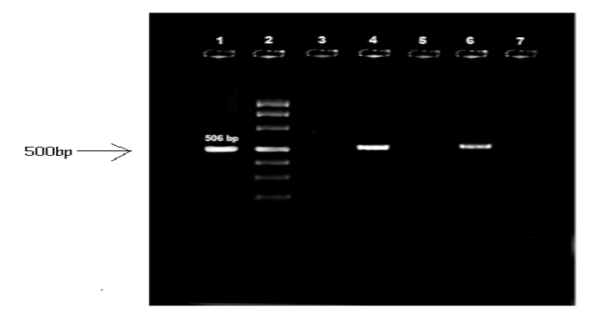
Figure 2: Electrophoresis of cag A gene PCR products on 2% agaros gel: Lane 2; Marker, line3; negative control, 1, 4 and 6; cag A positive (506 bp). M: 100 bp Ladder, size marker

Figure1: Amplification of for dupA genes: a) Amplification of jhp0917 gene Of H. pylori (307 bp). M: 100 bp ladder size marker, C-positive: 26695, J99, SS, 01 to 04: positive samples and C-negative control. b) Amplification of Jhp0918 gene of H. pylori (276 bp). M: 100 bp Ladder, size marker, C-positive: 26695, J99, SS, 01 to 04: positive samples and C-negative control.