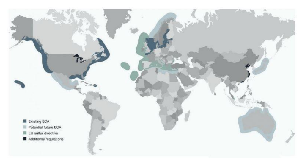
Figure 1. Current and future Emission Control Areas [4].

With IMO's current regulation, on-force by January 1^{st} of 2020, the amount of sulfur in marine fuels will be limited to 0.5% of total fuel mass. Moreover, IMO's limit for the share of sulfur in fuel has already been 0.1% for Emission Control Areas (ECAs) since 2015 [3].