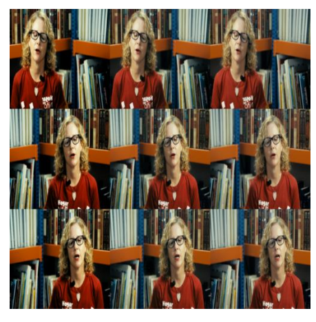
Figure 10. Training the cGAN on image sequences as a group produces a more consistent look. Left is the uncorrected input, middle the cGAN output, and right, the corrected target image. Note the random image flipping in the sequence

Our other solution to the variability of concurrent images was, as discussed above, to increase the dimensions of our data tensor to read in image sequences all at once, creating a temporal dimension. By altering the data tensor so that the cGAN trained on a four dimensional 'image'—X, Y, image number , color channel—it learned to generate sequences of images with little variation between them. Due to memory constraints we were limited to 18 images per sequence, but this number of frames was effective at reducing variation between frames to a very small amount. One interesting discovery when training on four dimensional images was that flipping the horizontal dimension of random images within the sequence actually worked better than keeping them all in their original horizontal configuration. Figure 10 shows a portion of an image sequence (with random flipping), indicating that this solution creates consistent output images over a sequence.