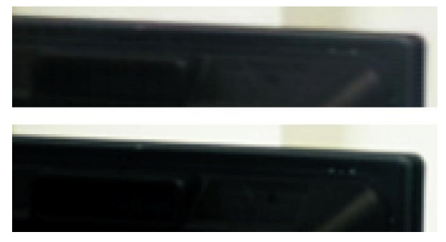
Figure 8. The cGAN run on a standard sized image (100% in X and Y), on top, versus a 2X oversampled image (200% in X and Y), on bottom. A blown up portion of the image is shown here in order to reveal fine detail

The second problem area with the cGAN is more pernicious: as each image is run through the network individually, spurious pixels or patches can appear in one image that disappear (or move about the image) in the next. In addition, images can be corrected to different solutions when they are being created individually, thus producing images that have slightly different general characteristics (e.g., the color cast in one might be very slightly bluer than the color cast of another). When examining an individual image these rogue elements are generally slight variations, and thus are relatively invisible (or at the least inoffensive to the viewer). When viewed one after another in a moving image sequence, however, the changes between each image can produce a flickering appearance that is distracting.