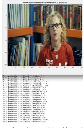
Figure 6. The network fails to generalize to images with multiple color correction issues. The network here predicts the image is too orange, with 100% confidence, while the true issues are too blue and too green