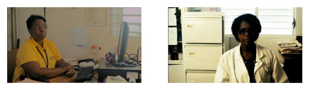
Figure 3. Two source images showing the low frequency nature of color correction issues. The left image has its white point set 100% too low, while the right image has its contrast set 100% too high

For both networks, we randomly selected approximately 2/3 of the 16,200 images for training, with about 1/6 for testing, and 1/6 held out for validation. While our concerns for each network were significant, they are, interestingly, complementary. While the classification network needs a labeled dataset and might not generalize as well, the cGAN does well in these areas. On the other hand, where the cGAN might introduce noise or softness into the image, the classification network, as it only detects problems, cannot introduce any image degradation. For both networks, our interest was primarily in low frequency issues, like color casts or issues with contrast, as shown in Figure 3. Therefore, we adjusted the parameters of each network to be more attuned to low frequency issues as opposed to the more usual concern researchers have with high frequency elements of images (e.g., feature detection).