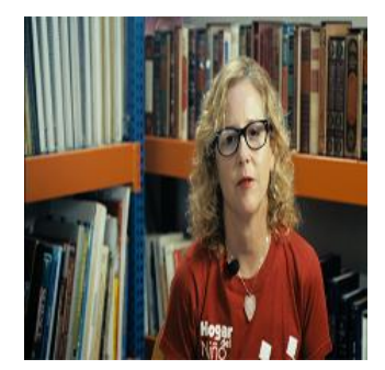
Figure 1. A sample input image with horizontal dimensions compressed to create a 224X224 square for the classification network

For our classification network, we utilized MatConvNet, an open source convolutional neural network construction system built to run within MATLAB (MatConvNet 2017), modifying the fast VGG classification network included in the package. As noted above, and shown in Figure 1, images were compressed in the horizontal dimension so that they filled a 224X224 square, which is the network's expected input dimensions. The images we used, which are in .png format, have values for each pixel which are by default doubles in UTF-8 encoding (even though they are 0-255 integers). As MatConvNet assumes every number in its data tensor is a single precision number, we had to convert the images (the .data tensor in the database) to single using the single(imdb.images.data) command in MATLAB. Though CNNs have traditionally been trained primarily to deal with the high frequency aspects of images, they worked very well for our focus on low frequency issues within the test images.