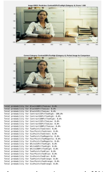
Figure 5. Correct classification that the source image's contrast is 33% too high. Note that the confidence in the result is 100%

To test our network under more real-world conditions, we input several images with two detuning issues, and a few images that were simply out of camera and not corrected. Unfortunately, the network performed poorly on these. Attempting to run the network on images with two classes of problems at the same time, as well as on images with unspecified problems, demonstrated that the network failed to generalize properly, as shown in Figure 6. We thus adjusted our training methodology, most notably inserting three dropout layers after the last three batch normalization layers, with up to 80% dropouts. Though this slowed training down considerably it did not resolve the underlying issue of network generalization to other images.