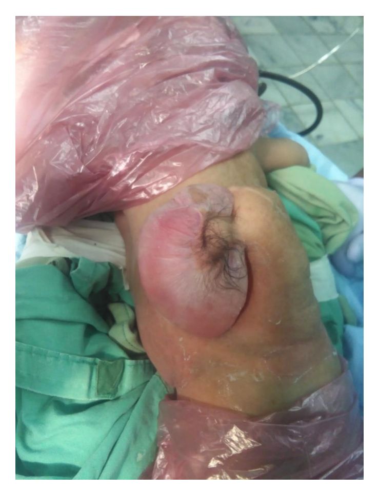
Figure 1. A mass located and arising from the lumbo-sacral area which had firm cystic and solid components on palpation. A tuft of hair could be seen on the surface as well.

Most authors mention a clear predominance of the male sex with about 78% being males. Until now, no particular risk factors for developing heteropagus twins have been reported (Aktar et al., 2012). However, a case report from Niger has identified consanguineous marriage in both cases of their case report (Sanoussi et al., 2010).