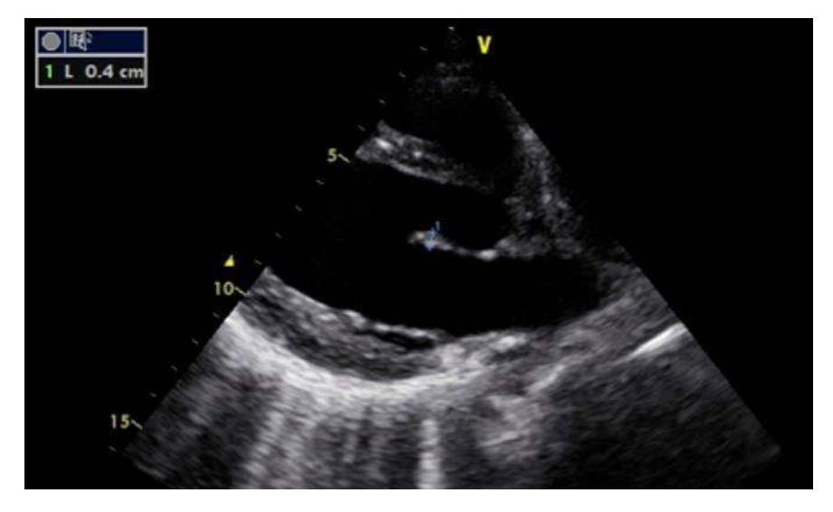
Figure 3. Parasternal long axis view showed thickening of the tip of anterior mitral leaflet (4 mm) and mild calcification.

parasympathetic tone may have precipitated arrhythmia (Freed et al., 1985). BVT had been reported previously in the case of fulminant and sub-acute myocarditis (Berte et al., 2008). VT had also been reported to be associated with acute phase of rheumatic fever and rheumatic heart disease (Freed et al., 1985; Shah et al., nd). This is the first reported case of BVT associated with subclinical carditis in RFR.