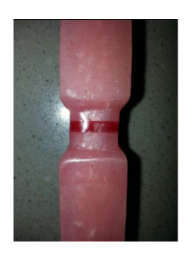
Figure 1. Acrylic specimens with 3mm wax in its narrowest part

Using soft liners: Each group were divided into two subgroups of 9 specimens for better investigation of each subgroup with one type of soft liner. To put and process the liners, a wax (Betadent-Macu-Iran) thickness equal to the thickness of the liner was placed in a 3-mm space (Figure 1). Then, to prevent any disturbance in the flasking process, the excess wax was removed using scaple and no 15 blade.