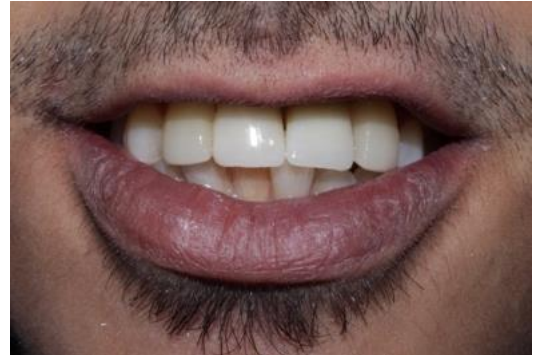
Fig. 16:Post-treatment smile.