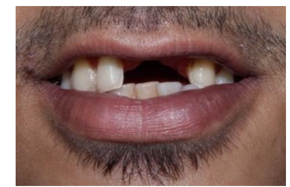
Fig. 15: Pre-treatment smile