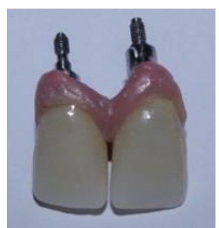
Fig. 11: Definitve prosthesis

Thereafter, the ceramic of the various parts of the definitive prosthesis were glazed. The abutment screws were tightened to a torque of 30N, followed by blockage of the screw-access hole with gutta percha and composite resin.