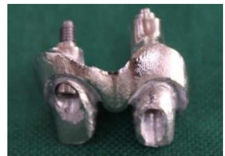
Fig. 8: Definitive titanium framework

Once the alterations were made, the screw-retained, definitive titanium framework was milled using computer aided manufacturing and verified intra-orally. Subsequently, the gingival aspect of the framework was layered with pink ceramic in addition to application of an opaquer over the abutments.