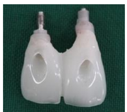
Fig. 6: Polymethyl methacrylate trial

On approval of the design, a polymethyl methacrylate trial was 3D printed and checked intra-orally for any modifications. Care was taken to ensure a correct angulation of the abutments along the contour of the maxillary arch in addition to a satisfactory level of the gingival zeniths and extra-oral lip support.