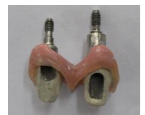
Fig. 9: Ceramic soft tissue moulage on the titanium framework