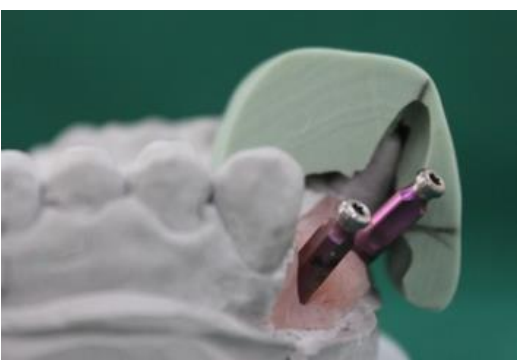
Fig. 4: Buccally tilted implant angulation. Note – correct tooth angulation depicted by the putty index.