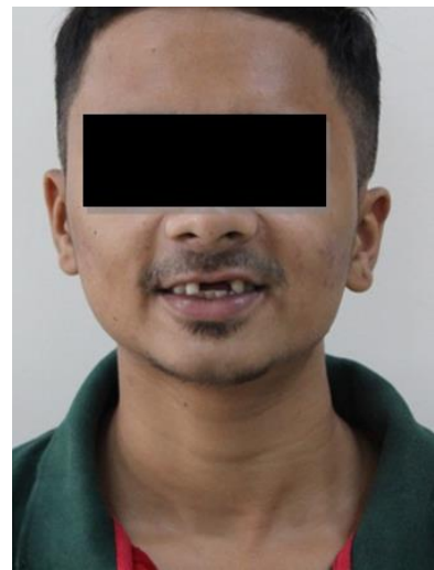
Fig. 13: Pre-treatment extra-oral view

The zirconia crowns were cemented with a resin reinforced glass ionomer cement (Fuji Cem, GC) and the laminates with a resin cement (Calibra).