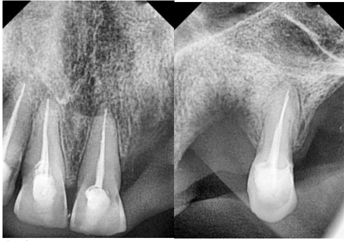
Fig. 3: Post-endo RVG