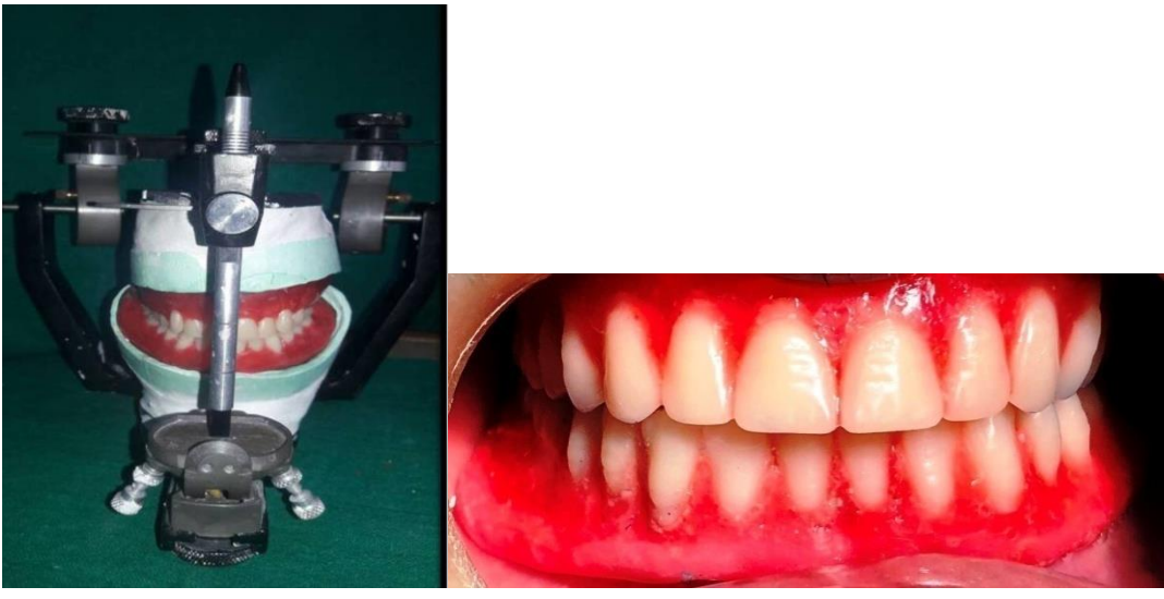
Fig. 7: Try in