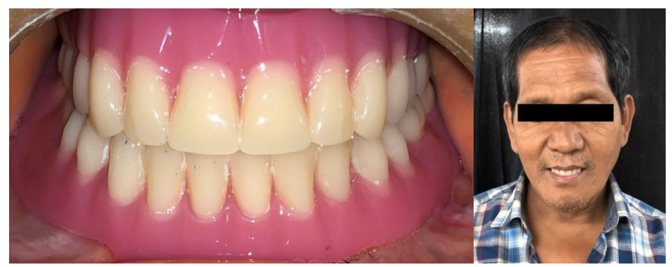
Fig. 8: Final denture insertion