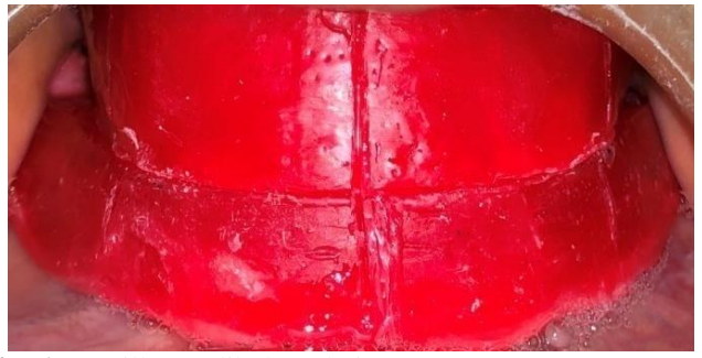
Fig. 6: Maxillomandibular relation