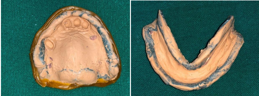
Fig. 5: Maxillary and mandibular final impression