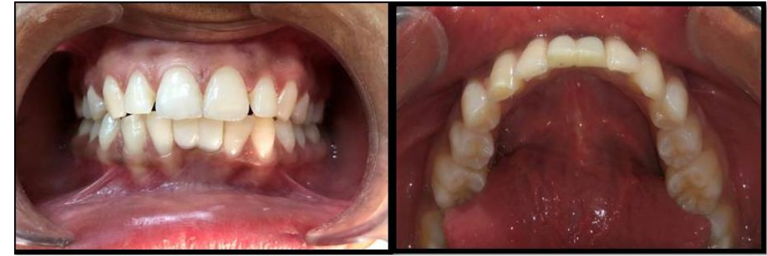
Fig. 3: Final intraoral view of the finished bridge