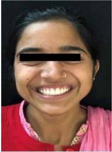
Fig. 4: Post-operative extra oral photograph