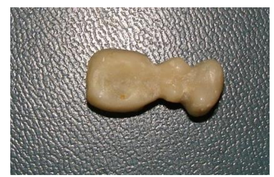
Fig. 10: Provisional Restoration