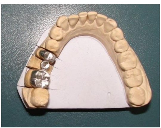
Fig. 11: Casting procedures