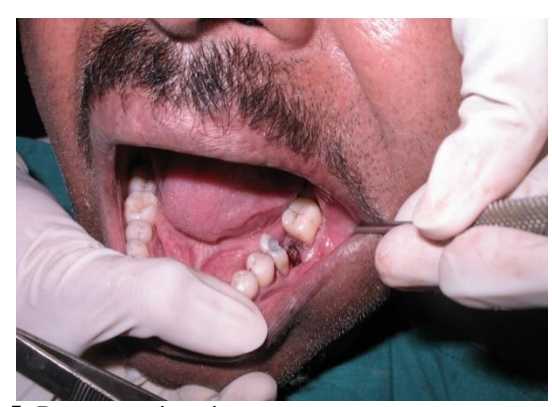
Fig. 5: Post-operative view