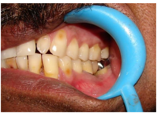
Fig. 14: Post-operative view