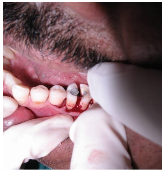
Fig. 4: Sectioned mandibular molar