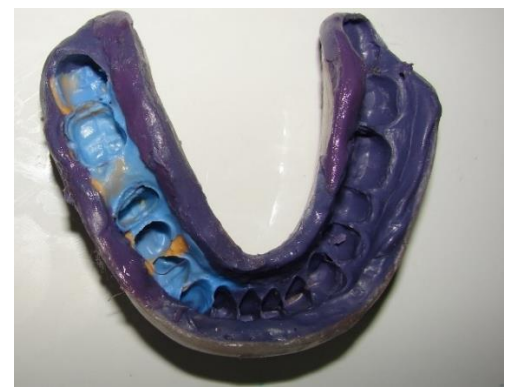
Fig. 9: Final Impression