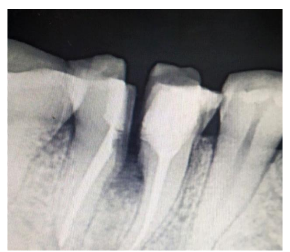
Fig. 4: Showing hemisection