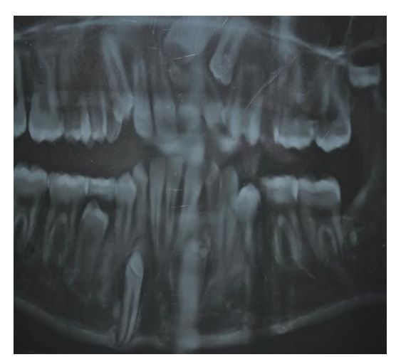
Fig. 1: OPG shows multiple impacted teeth

Correlating with the clinical and radiographic picture, the histological description of haphazard deposition of dental tissue was most consistent with the diagnosis of complex composite odontome.