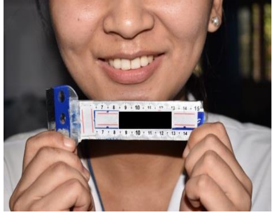
Fig. 1: An example of photograph of the participant during the posed smile, shaded part contains the code number, age and gender of the participant

Parallelism was studied whether incisal edge of maxillary anterior teeth are parallel to upper border of lower lip, or in straight line or in reverse relation. In smile, we also studied whether lower lip touches, does not touch or even covers the incisal edges of maxillary anterior teeth. Number of teeth exposed include whether canines, premolars or molars are seen or not during smile. In assessing the deviation factors (Fig. 2), we checked for presence of midline diastema, multiple gaps, interincisal gap, and canting of upper lip during smile.