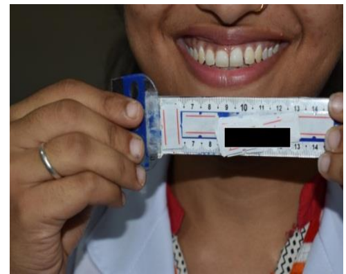
Fig. 2: An example of smile with high lip line and multiple gaps between teeth