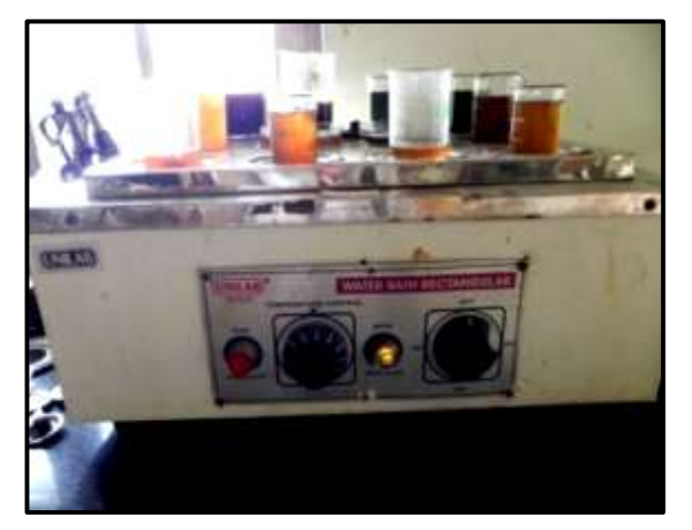
Figure 3 Water bath