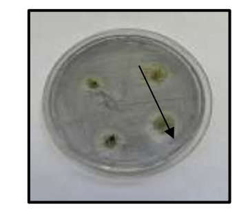
Figure 8 and 9 Zones of Inhibition (Aqueous Alcoholic)