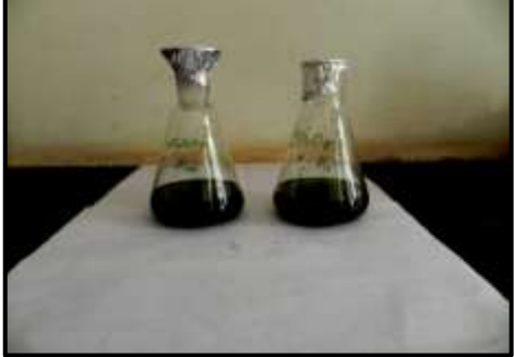
Figure 1 24 hours Maceration

The ampoules containing freeze dried forms of the microorganisms were opened and these contents were added to nutrient broth and incubated at 37^{\circ} C overnight. The growth obtained on the plate was transferred on to a blood agar plate to test the antimicrobial activity<sup>1</sup>.