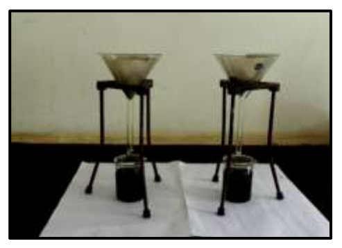
Figure 2 Filtration