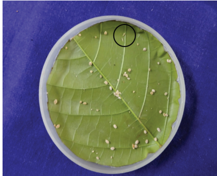
I instar predator on Planococcus citri

158.00±5.24, 35.00±2.73 and 23.60±2.87 first, second and third instar nymphs of P. citri , respectively. Among various instars of the predator, second and third instars were voracious and consumed 224.40±4.14, 69.20±3.27, 41.00±3.16 and 326.60±2.96, 116.20 ±6.45 and 97.40±2.05 first, second and third instar nymphs of P. citri , respectively (Table 1).