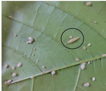
III instar on P. citri