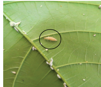
III instar on Paracoccus marginatus