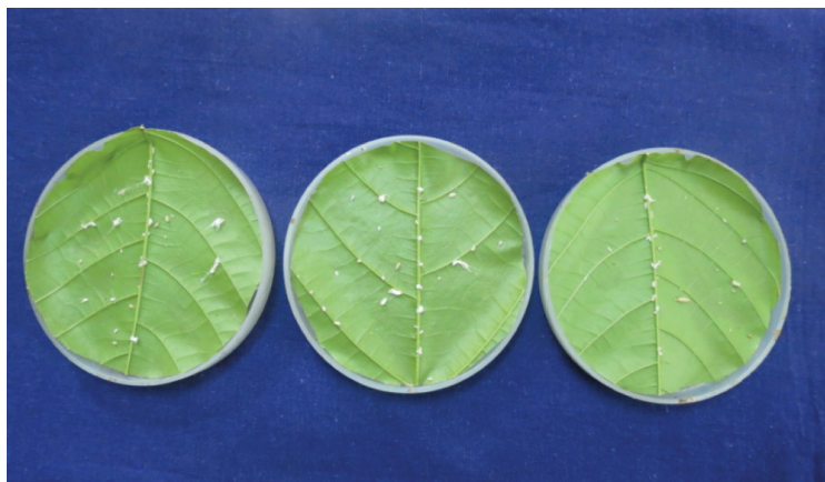
Different instars of C. zastrowi sillemi on Paracoccus marginatus