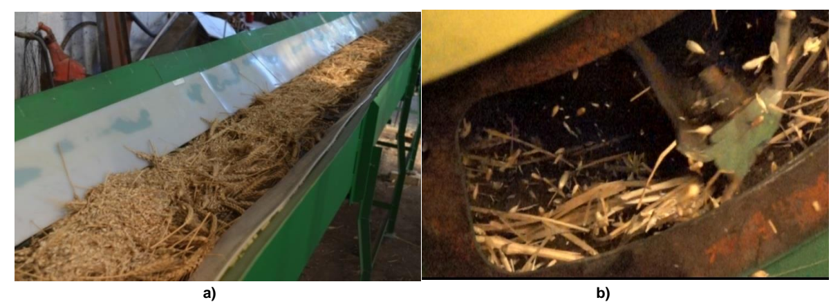
Fig. 2 – a) laboratory feed conveyor with stripped heap of winter wheat; b) high-speed shooting frame of the threshing process

High-speed shooting made it possible to have a good look at the threshing process during the passage of the stripped heap in the threshing device. When the unit worked with a deck having 9.0 mm gap between bars and the peripheral speed of 31.4 m, grain crushing achieved 1.91%, which is almost equal to the damage level with serial deck -1.90%. It was determined that when the gap was decreased to 7.0 mm grain crushing increased to 2.35%.