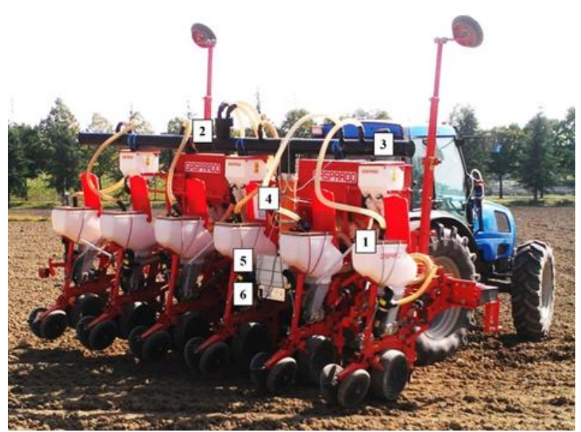
Fig. 5 - Modified drill with the recycling-filtering device proposed by CREA.

The filtering-recirculating system by CREA is a device that works as an "impactor", decreasing the air speed and favouring the dust deposition inside the pneumatic circuit; finally, a filter retains particles before the final air expulsion (Fig. 5 and 6).