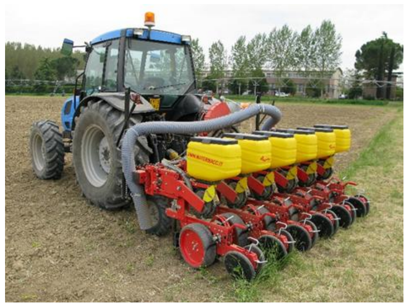
Fig. 1 - The deflectors proposed by Syngenta (dual pipe system)

Manufacturers and researchers have proposed some devices to decrease dust drift emissions generated by the pneumatic drills. The deflector system consists of a steel frame, applied at the fan opening, from which the air is directed close to the soil or into the furrows opened by the sowing units, by means of flexible plastic pipes (2 or 4). Generally, deflectors are an aftermarket solution applicable to different seed drill models and they can be easily mounted and dismounted on the seeder. The reduction of dust drift is due both to the position of air exit and to the reduction of the air speed by ejecting the air via several pipes instead of one single outlet. The "dual pipe deflector" by Syngenta splits the air coming from the drill's fan in two secondary pipes which convey the air stream close to the soil, between the central seeding elements (Fig. 1).