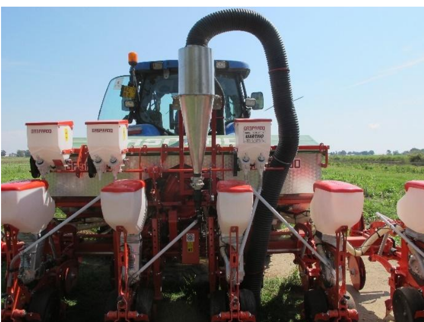
Fig. 3 - The cyclone based system proposed by Bayer (sweep air system)

Bayer has also developed a system (SweepAir® system) (Chapple et al., 2014; Vrbka et al., 2014) based on a cyclone filter. Exhausted air from the pneumatic drill's fan is conveyed through a "primary pipe" that connects the fan outlet to the cyclone inlet (Fig. 3). The separated dust is conveyed downwards in the cyclone and then deposited into the soil. The tests, carried out using tracer materials to simulate the seed dressing dust, showed that the cyclone system effectively separated 99.4% of the inert material (Manzone et al., 2015).