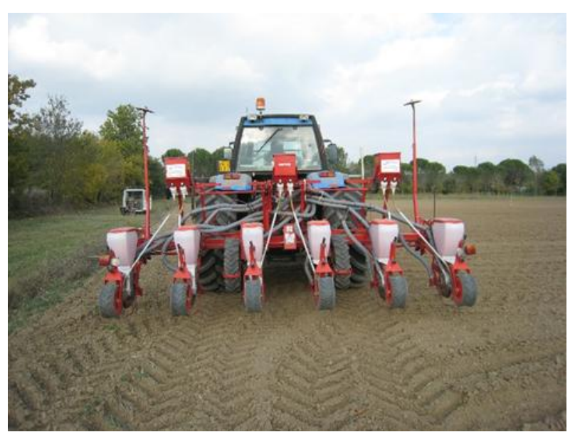
Fig. 2 - The deflectors mounted by the drill manufacturer Gaspardo

Another deflector system consists in a four pipes system (Fig. 2). According to Nikolakis et al. (2009) the deflectors can reduce the ground deposition of dust by more than 90%.