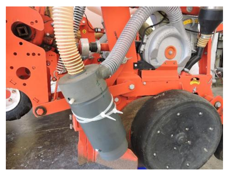
Fig. 4 - The small cyclone mounted before the seed heads proposed by ILVO

The system was then mounted on a drill and it showed a reduction of 99% of dust residues collected at ground level and of 90% to 92% when the drift was assessed in the air, depending on the sampling method (active or passive samplers) (Foqué et al., 2018).