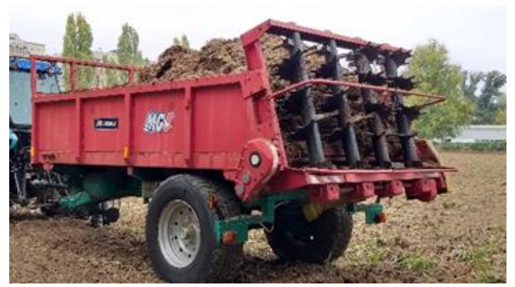
Fig. 1 - Organic fertilizer spreader MG

The process parameters considered in this study are given in Table 1, taken from Stefan at al. (2019) . According to the same work, we reproduce Table 2, which gives the statistical characteristics that rank the connections between the quality parameter, \sigma and the other parameters considered.